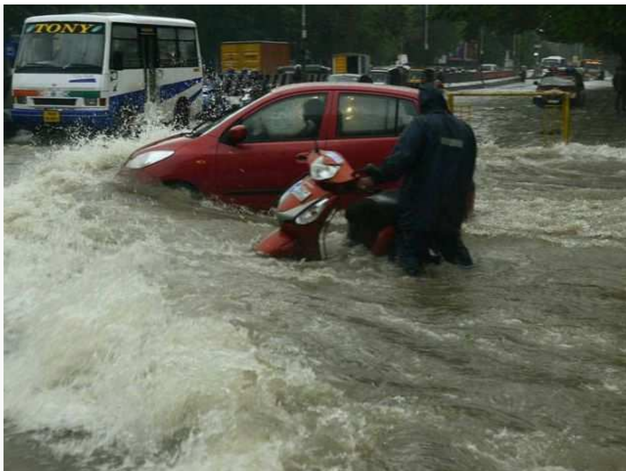
Vehicles negotiate a flooded Poonamallee High Road.