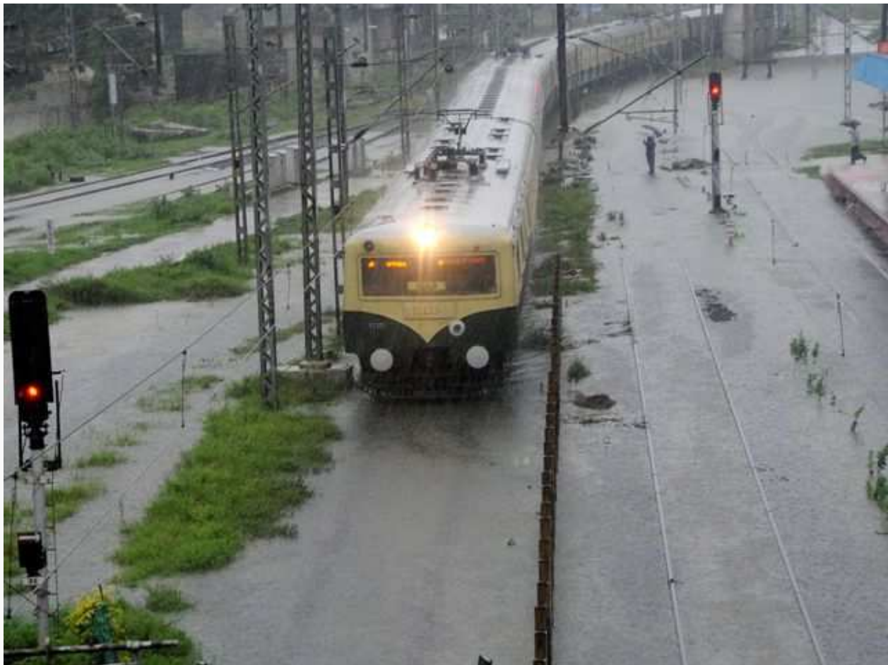
Train service between Tambaram and Beach was disrupted due water logging on the tracks.

Boats had to be called out once again to rescue residents caught in their workplaces and homes, after floodwaters entered the buildings. Water release from the reservoirs and the breaching of over 60 tanks in south Chennai contributed to the extensive damage in the city.